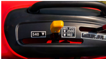
5. PTO lever