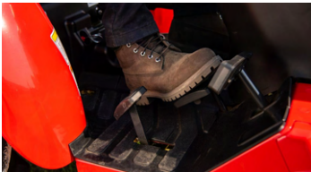
4. Responsive forward/reverse HST (2400H)