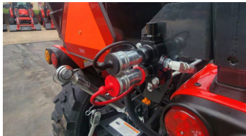
6. 2 port rear hydraulic control (optional)