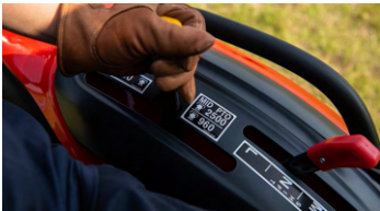
3. Ergonomic lever