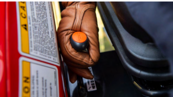
3. Ergonomic lever