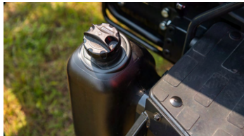
5. High-capacity fuel tank