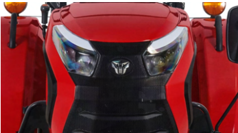
1. New iconic hood