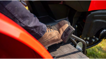
4. Responsive forward/reverse HST (3515H)