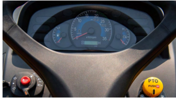
6. High visibility instrumental panel