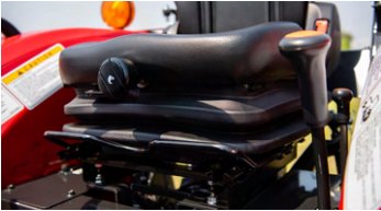
2. Comfortable suspension seat