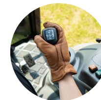
6. Front-end loader joystick lever