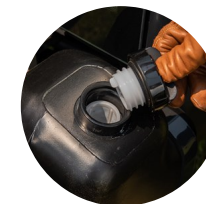
5. High-capacity fuel tank