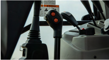
4. Main shift D clutch