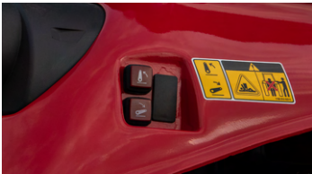
3. External hitch control buttons