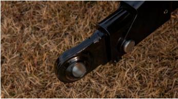
6. Extendable lower link ends