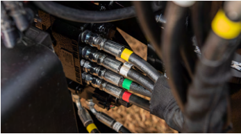
2. 3rd function