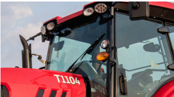
1. Front wipers