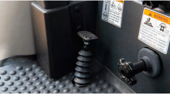
4. Differential lock