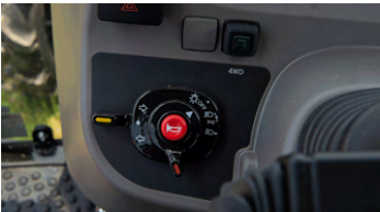
1. Selectable 4WD