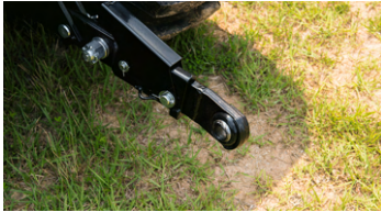
6. Extendable lower link ends