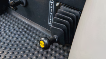
2. PTO shift lever