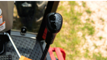
3. Joystick control for front-end loader